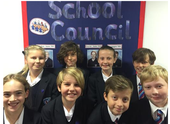
The Turing House School Council

Our School Council have now met on three occasions and have begun to shape some of the things we will be doing from now until Christmas. Agreed this week are to celebrate the National Christmas Jumper Day in December and have an Inter-form bake off/cake sale for Children in Need in November.