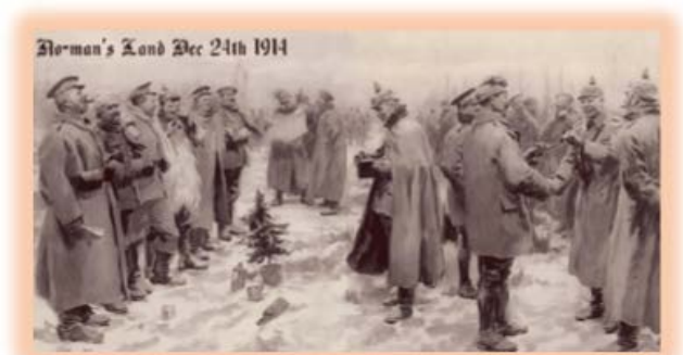
Christmas: a time of peace and goodwill to all.

We do hope you'll be able to attend the event and join us for mulled wine and mince pies afterwards organised by Turing House Friends.