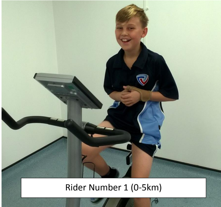
Rider Number 1 (0-5km)

The Space to Earth was a fantastic success with students and staff easily reaching the target of 800km. In the end we had four bikes operating near the science room with some 80's music to keep our students and staff motivated.