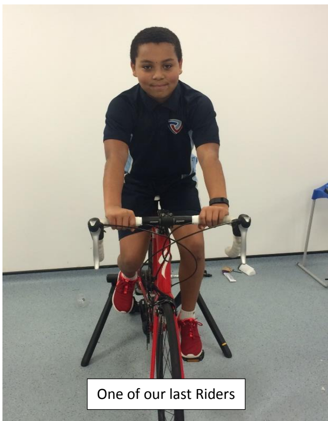
One of our last Riders