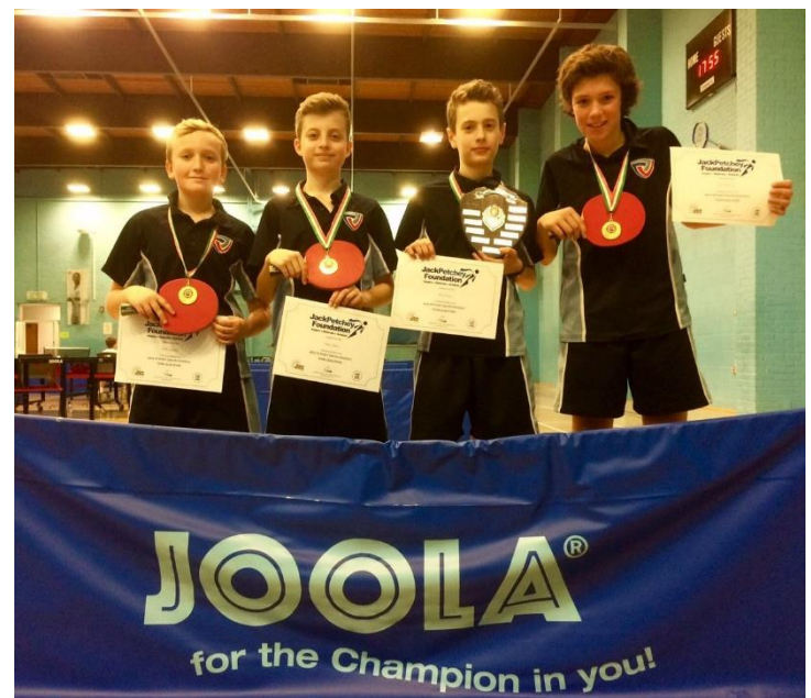
Table Tennis – South London Plate Winners