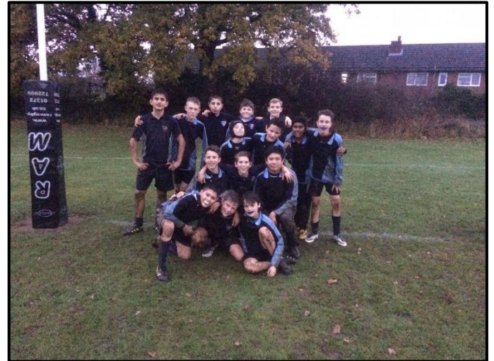
Hinchley Wood 5 – Turing House 15

Congratulations to the Year 8 Rugby team on a fantastic win against Hinchley Wood !