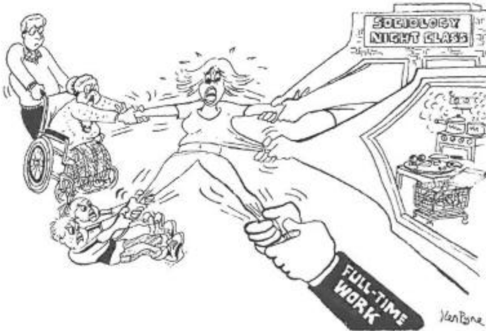
Role conflict for working women

Norms are social rules which define the correct and acceptable behaviour in a society or social group to which people are expected to conform. Norms are much more precise than values: they put values (general guidelines) into practice in particular situations. The norm that someone should not generally enter rooms without knocking reflects the value of privacy, and rules about not drinking and driving reflect the values of respect for human life and consideration for the safety of others. Norms exist in all areas of social life. In Britain, those who are late for work, jump queues in supermarkets, laugh during funerals, walk through the streets naked or never say hello to friends when they are greeted by them are likely to be seen as unreliable, annoying, rude or odd because they are not following the norms of expected behaviour. Norms are mainly informally enforced – by the disapproval of other people, embarrassment or a ‘telling off’ from parents or others. Customs are norms which have lasted for a long time and have become a part of society’s traditions – kissing under the mistletoe at Christmas, buying and giving Easter eggs or lighting candles at Divali are typical customs found in Britain.